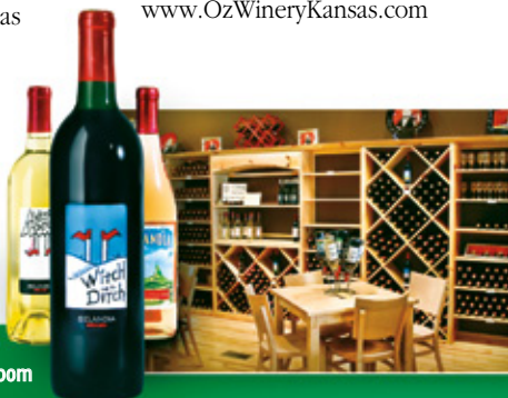
Sample award winning wines in the Oz Winery tasting room

417 Lincoln Ave · Downtown (785) 456-7417 Mon-Sat 10am to 6pm Sun Noon to 5pm www.OzWineryKansas.com