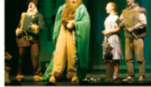
Join us in "OZtober" for the annual OZtoberFest celebration!